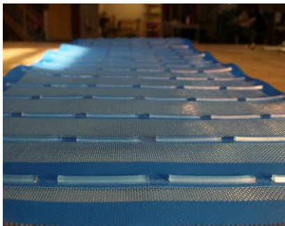
Chlorine resistant cleats and vguides can be added to the belts.

Belts are made with chlorine resistant compounds that withstand chemical wash-downs better than traditional PVC and PU reinforcement